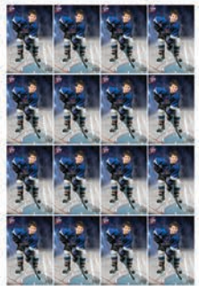
16 WALLETS $16.00 / SET