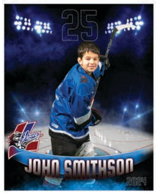
16 X 20 POSTER $35.00 EA