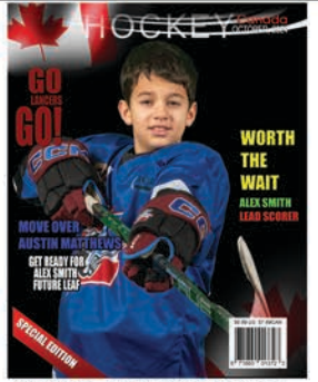
8X10 MAGAZINE $16.00 EA (BLACK BACKGROUND ONLY)