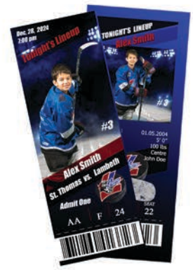
ARENA TICKETS $25.00 4/ SET (STADIUM BACKGROUND ONLY)