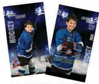
TRADING CARDS $25.00 8/ SET (STADIUM BACK GROUND ONLY)