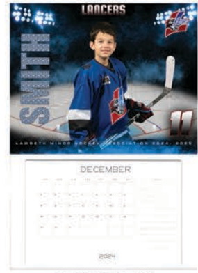
13 MONTH CALENDAR $25.00.00 EA