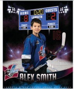
8X10 PORTRAIT $16.00 EA