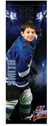
10X30 LOCKER / DOOR POSTER $35.00 EA