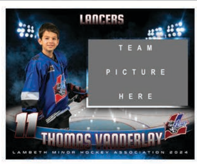
8X10 PLAYER/ TEAM COLLAGE $16.00 EA