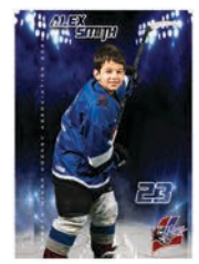
FRIDGE/ LOCKER MAGNETS $25.00 4/ SET (STADIUM BACK GROUND ONLY)