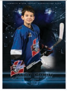
5X7 PORTRAIT $ 11.00 EA